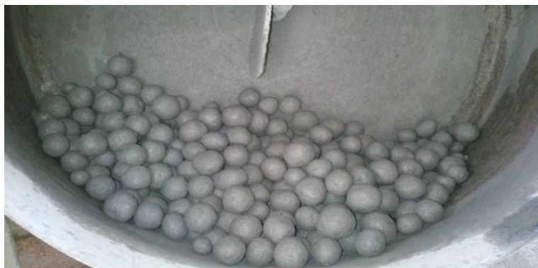
Fig. : Pelletization Machine

The crave growth size distribution of an unnatural lightweight aggregate is either crushed or by means of agglomeration process. The pelletization process is used to manufacture lightweight coarse aggregate; some of the parameters need to be considered for the efficiency of the production of pellet such as speed of innovation of pelletizer disc, moisture content, angle of pelletizer disc and period of pelletization (Harikrishnan and Ramamurthy, 2006). The different types of pelletizer machine were used to make the pellet such as disc or pan type, drum type, cone type and mixer type. With disc type pelletizer the pellet size trading is easier to regulate than drum type pelletizer. With mixer type pelletizer, the small grains are formed initially and are subsequently increased in particle size by disc type pelletization (shown in Figure 1, Bijen, 1986). The disc pelletizer size is 570 mm diameter and side depth of the disc as 250 mm, it is fixed in a flexible frame with adjusting the angle of the disc as 35 to 55° and to control for the rotate disc in vertically manner should varying speed as 35 to 55 rpm shown in Figure 2 (Manikandan and Ramamurthy, 2007).